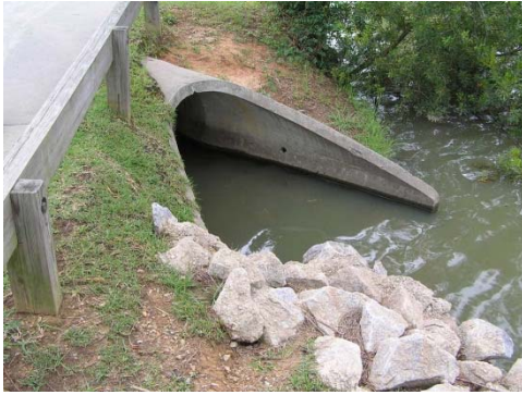
Use Pipe Flared End Section when specified in the plans or special provisions.