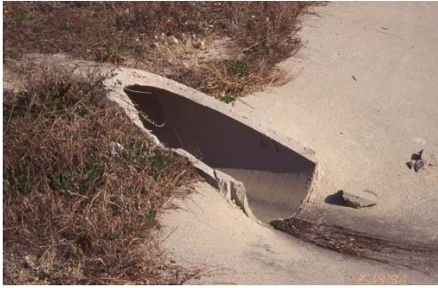
EXHIBIT 5 – SPECIAL PROVISIONS AND CONTRACT REQUIREMENTS

Use Beveling of Pipe End (719-610-00) when specified in the plans or special provisions. Beveled ends may only be used on flexible pipe up to 24" diameter and on rigid pipe up to 60" diameter. When beveling of pipe ends is specified on flexible pipe larger than 24" diameter, install pipe straight headwall, pipe end structure, flared end section, or wingwall section. Use factory fabricated beveled ends for all pipe types unless approved by the Engineer.