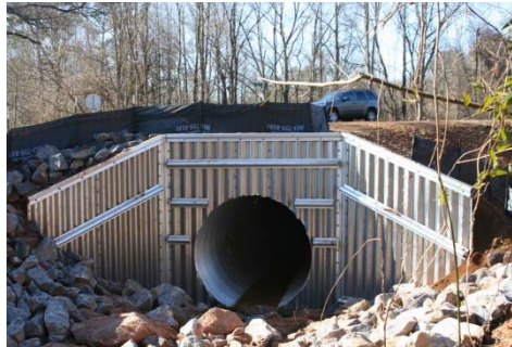
Use Pipe Wingwall Section when specified in the plans or special provisions.

Completely seal interface between pipe and end treatment with grout. If bricks or shims are used to place pipe, take care to remove all air pockets and voids when grouting.